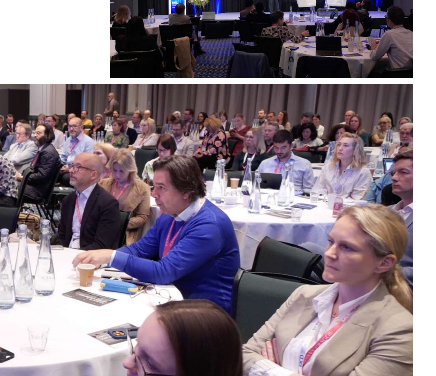
The Introvert Space leading a workshop for Communication Directors at the 2024 EACD

Whether you're an organisation looking to create an inclusive workplace or an individual seeking strategies to thrive, we offer insights and solutions designed with introverts in mind.